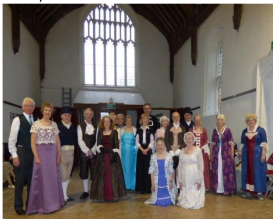
Costumed dancers at a Playford Tea-dance in Higham-Ferrers Bede House

Attendance numbers are usually in the low to mid twenties which allows us to try a range of dances in different formations. This is not like ballroom dancing where you dance as a couple with just your partner. In social dancing you dance in various sized-groups (sets) of people, in varying formations (circles, long sets, short sets, squares), and you may (or not!) stay with the same partner, but you will certainly interact with others as you progress through the dance. The dances we do range from simple barn/ceilidh dances to more complex courtly dances of the Stuart, Georgian /Regency and modern eras (e.g. as in "Jane Austen" costume dramas!). We also sometimes do modern American Square and Contra dances which are a bit more zesty and great fun! We usually manage 6 or 7 different dances each afternoon and we always try to include as many people as possible each time. No previous experience is needed as all the dances are explained and walked through before setting them to music. Nor do you need to come with a partner - singles (of both sexes) are welcome.