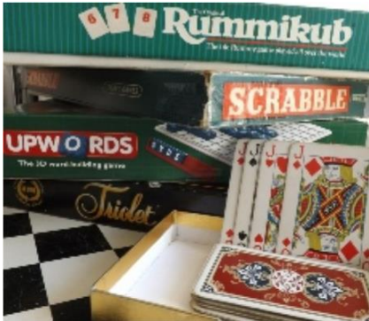
Table Top Games

Our meetings this month are on 13 & 27 February at 2:00p.m. in the Methodist Chapel.