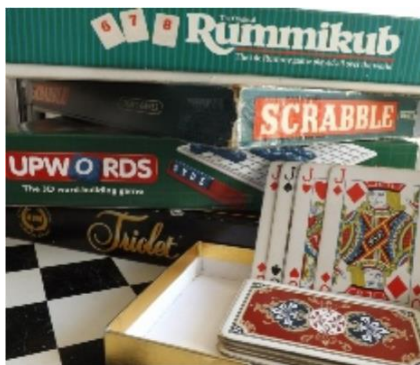
Table Top Games

Our meetings this month are on 13 & 27 February at 2:00p.m. in the Methodist Chapel.