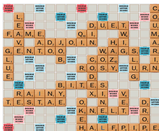
Table Top Games

After the summer break the group returns to its usual bi-monthly games sessions. We meet on the 2 nd & 4 th Thursday of each month, so 12 & 26 September, in the Methodist Chapel. It helps if you arrive at 1:55 p.m., so we can decide who will play what and with whom, for a 2:00 p.m. start.