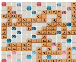
Table Top Games

After the summer break the group returns to its usual bi-monthly games sessions. We meet on the 2 nd & 4 th Thursday of each month, so 12 & 26 September, in the Methodist Chapel. It helps if you arrive at 1:55 p.m., so we can decide who will play what and with whom, for a 2:00 p.m. start.