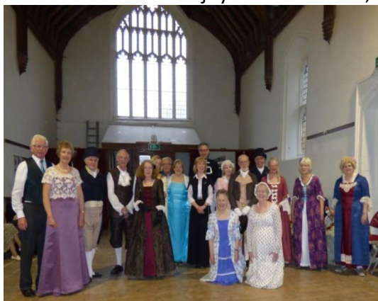
Costumed dancers at a Playford Tea-dance in Higham-Ferrers Bede House

However, some members of the group did attend the costume "Playford Tea Dance" at Higham Ferrers Bede House on March 8 just before the outbreak was announced. Music was by the Northamptonshire violin and accordion duo Childgrove who accompanied a range of Playford-style social dances including such favourites as Newcastle (1651) , Portsmouth (1670) , Shrewsbury Lasses (1765) , The Phoenix (1670) , The Hop Picker's Feast (1796) and The Emperor of the Moon (1690) . All in all it was a most enjoyable afternoon, and a chance for dancers to show-off their period costumes