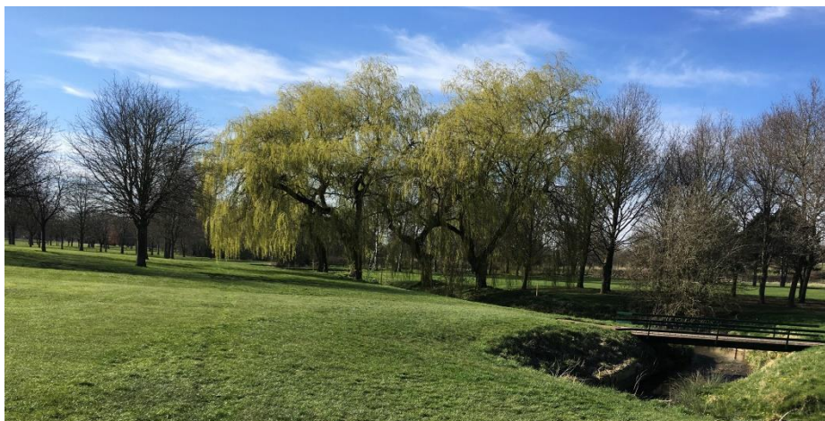
Leicestershire Golf Club

This group meets on the fourth Tuesday every month, weather permitting, at venues in and around Great Glen